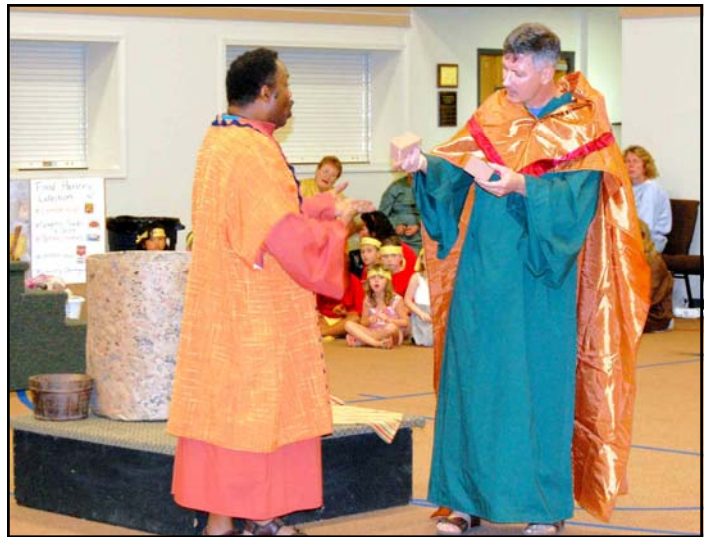
Wisemen discussing their gifts for the baby Jesus.