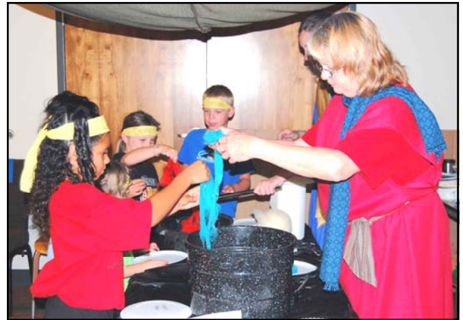
Children at the Dye Shop.