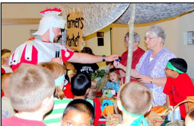
Roman Guard returning money to Shopkeepers.