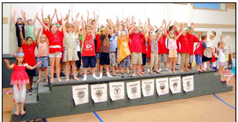
All the children on stage on Friday.