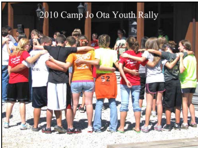
2010 Camp Jo Ota Youth Rally