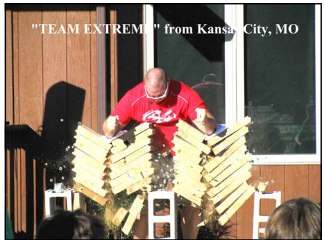
"TEAM EXTREME" from Kansas City, MO

We had a group of 24 youth & adults attend the Youth Rally on September 11 th & 12 th . "Spirit Camp Band," "Metamorphosis Camp Band" & "Never Blue Avenue" led us in praise & worship. The "Team Extreme" from Kansas City was the main speakers. They gave a challenging message from creation through the resurrection using feats of strength as object lessons. We were challenged to be bold & mighty warriors for Christ, living our entire lives for Christ- not just our Sunday mornings. Camp fire is a time for everyone to share their feelings & experiences with the group. What a joy to hear our youth share their testimonies!